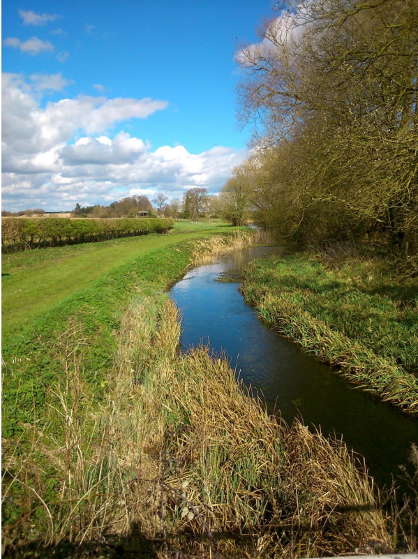
Scene along the route of the Walking Group walk from Ixworth to Pakenham