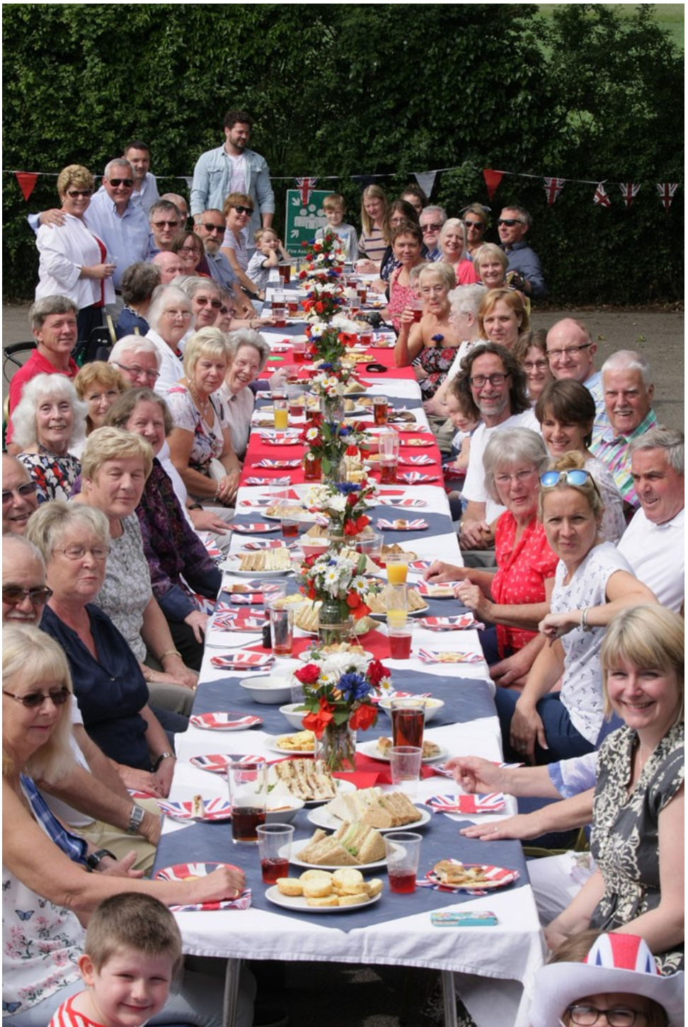
The Street Party at Battsiford Community Centre