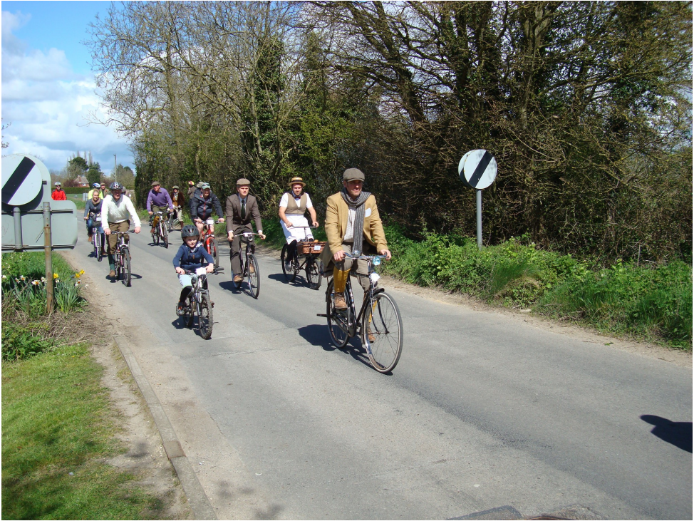
They set off into the unknown