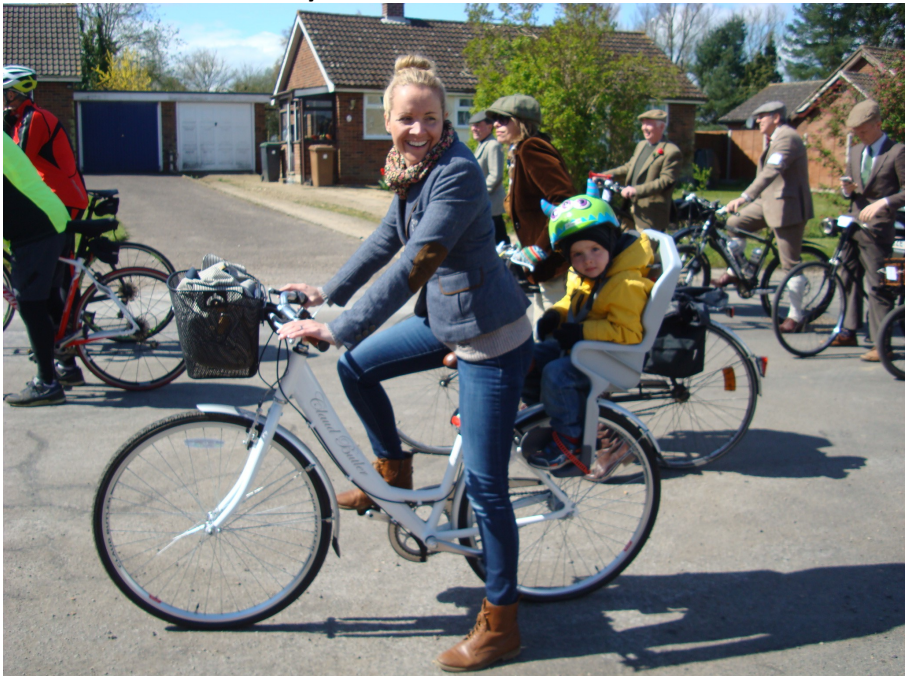
The youngest participant didn't do a lot of peddling!